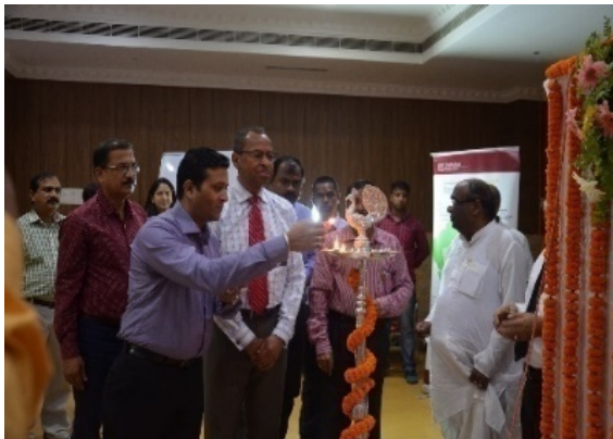
Project Launching workshop