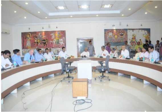
Hon' ble CM addressing media after MoU Signing

and dual-purpose crops (both seasonal and perennial) at department fodder farms and at farmers' fields, vi) demonstration of low cost silage preparation and sprouts production at farmer's field and capacity building of stakeholders.